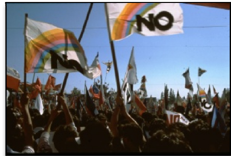
On October 7, 1988, the day after the plebiscite against Pinochet, more than a million Chileans celebrated in Santiago's Parque O'Higgins the victory of the NO.

In the same year, 1988, the fragile feet started to crumble. In a referendum in October the majority of the Chileans did not fear the threats of Pinochet that there could be another coup. They voted for the NO, for the end of Pinochet's dictatorship, for the end of political murder, forced disappearance and torture. The next day more than a million people celebrated in the enormous Parque O'Higgins.